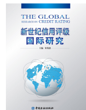
新世纪信用评级国际研究 The Global: Research on Credit Rating