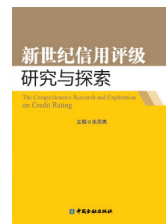
新世纪信用评级研究与探索 The Comprehensive Research and Exploration on Credit Rating