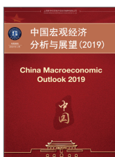
中国、新兴市场国家、发达国家宏观经济分析与展望 Macroeconomic Analysis and Prospect of China, Emerging Markets and Developed Countries