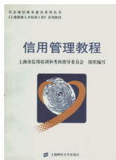
信用管理教程 Course of Credit Rating