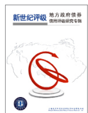
地方政府债券信用评级研究 Research on Credit Rating of Local Government Bond