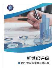
研究文章目录汇编 Catalog Compilation of Research Articles