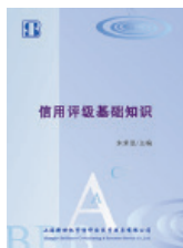
信用评级基础知识 Basic Knowledge of Credit Rating