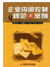
企业内部控制规范与案例 Internal control standard and case of Company