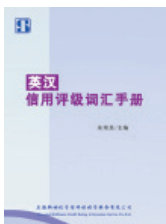
英汉信用评级词汇手册 English-Chinese Handbook on Terms of Credit Rating